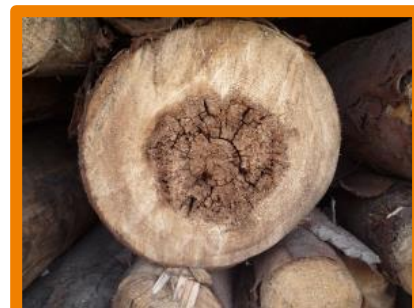
Not nail proof