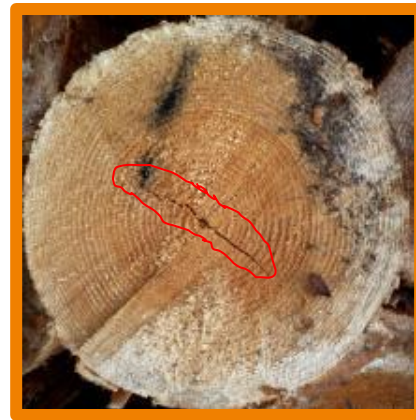
Superficial frontal core crack