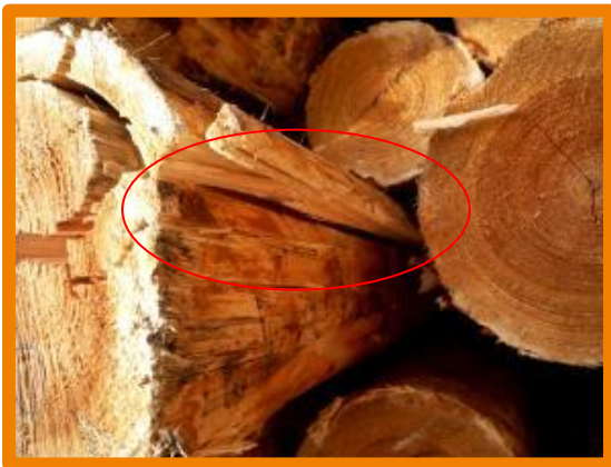
Crack on the lateral surface

Relevant are frontal and core cracks and also cracks on the lateral surface. Logs with just superficial frontal and core cracks are not downgraded, whereas logs with deep frontal and core cracks and also cracks on the lateral surface are downgraded.