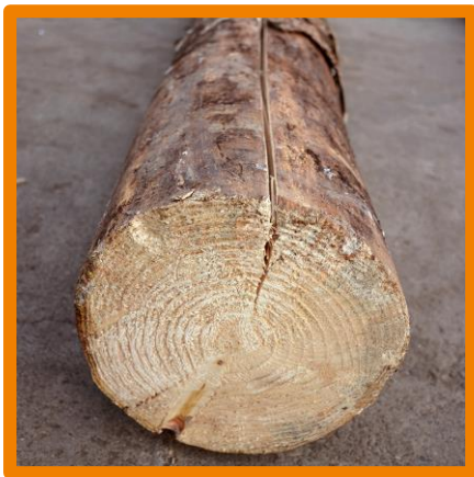
Crack on the lateral surface

core cracks and cracks on the just superficial frontal and core