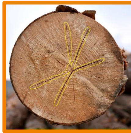
Superficial frontal core crack